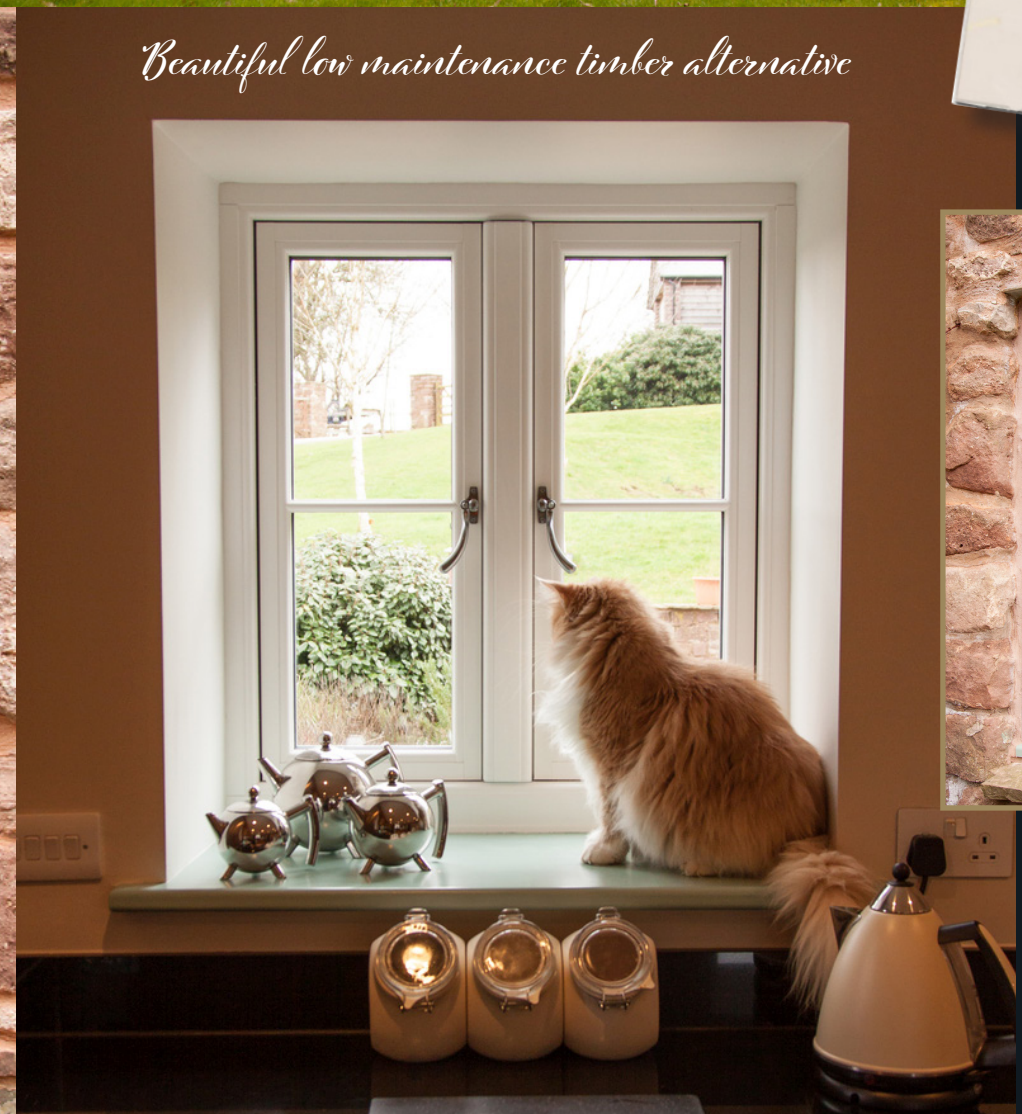
Beautiful low maintenance timber alternative