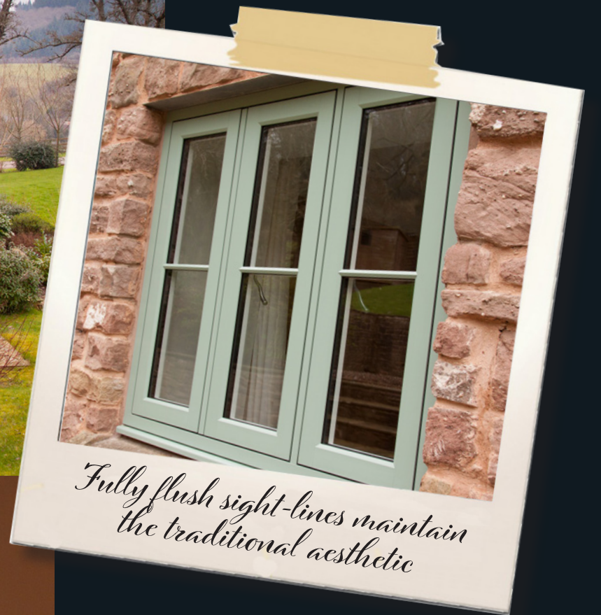
Fully flush sight-lines maintain the traditional aesthetic